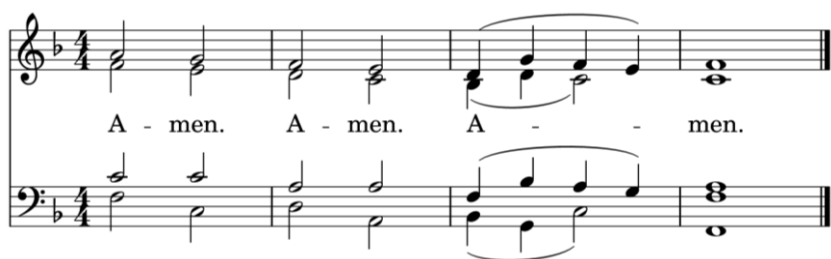
Danish Amen Mass

Through Jesus Christ our Lord, with whom, and in whom, in the unity of the Holy Spirit, all honor and glory be to you, Lord of all ages, world without end.