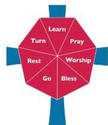
THE WAY OF LOVE Practices for Jesus-Centered Life

Learn more about the Way of Love at episcopalchurch.org/wayoflove . You can find suggestions on getting started and going deeper with Going at iam.ec/enol .