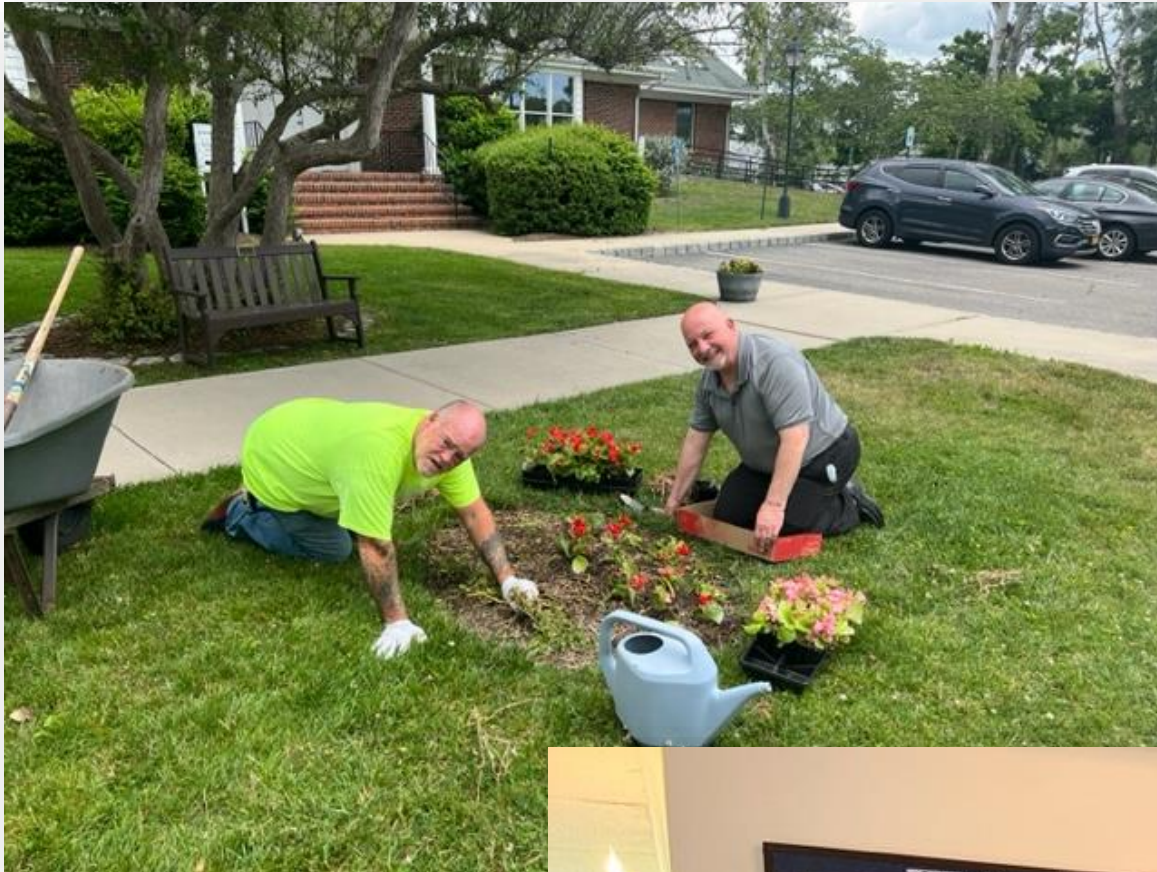
C & C Landscaping hard at work!