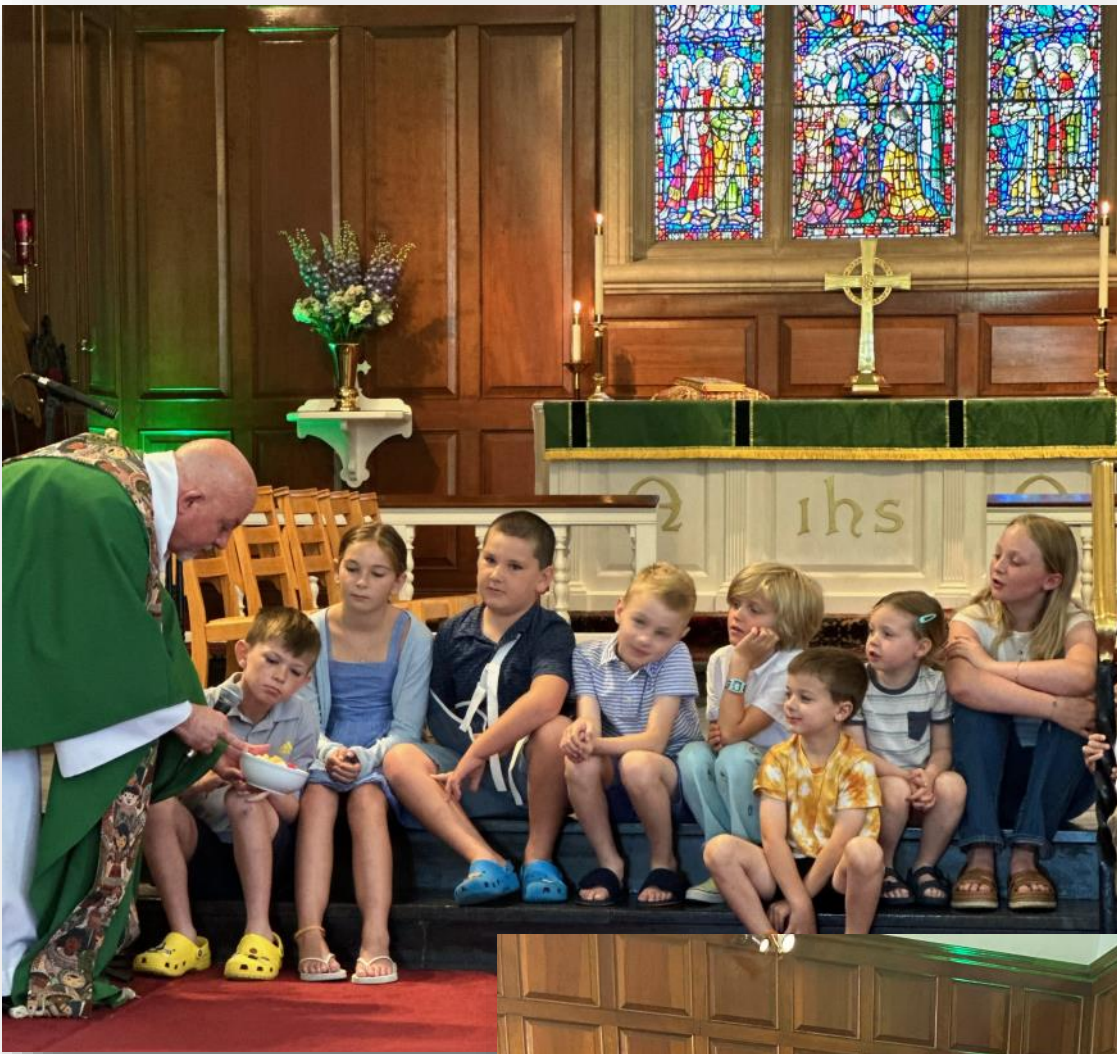
Youth Sunday on June 18 th