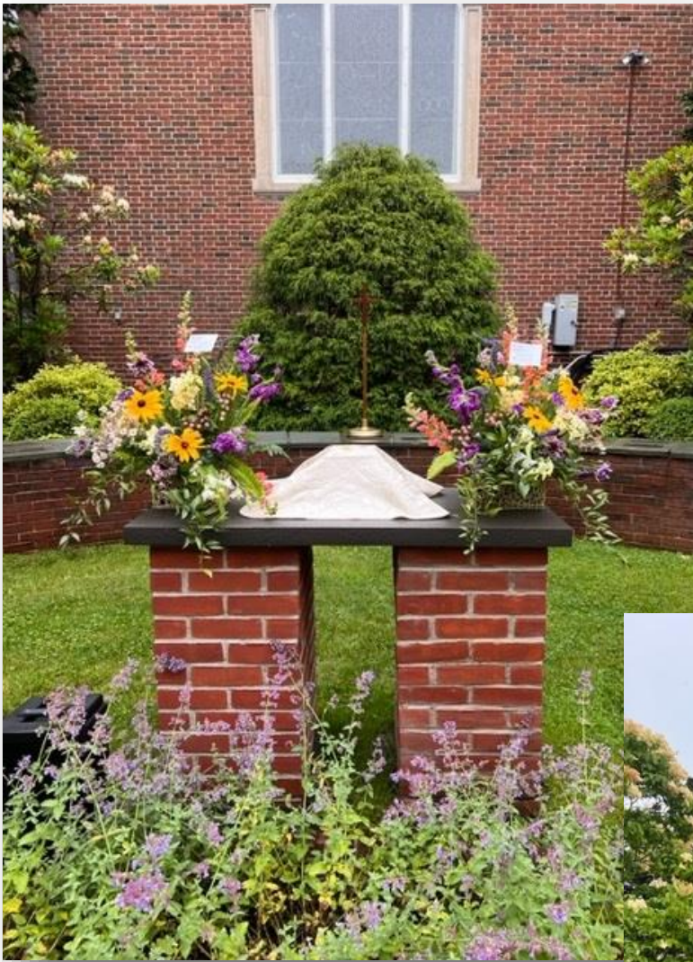
The Celebration of the Life of Pat Conklin in our Columbarium Garden Chapel on Saturday, June 24th.