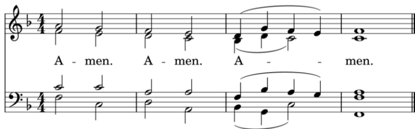
Danish Amen Mass

Through Christ and with Christ and in Christ, in the unity of the Holy Spirit, to you be honor, glory, and praise, for ever and ever.