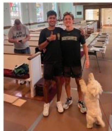
Our newest helpers

We will be needing a great deal of help to clean up the church for a funeral on the 14 September. There is also lots of sanding and finishing wood, which does not require brute strength. Even an hour means a great deal!