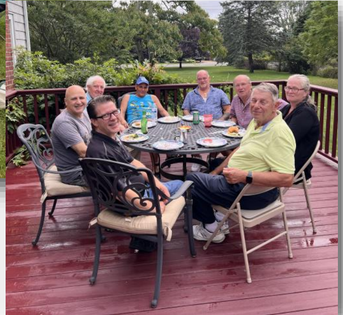
Parish Picnic at the Rectory on Sunday, September 10 th .