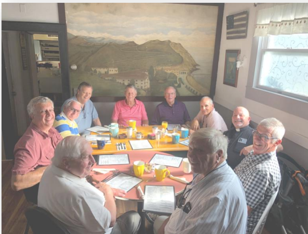
The Men's Breakfast Group meeting at Eckart's Luncheonette on Saturday, September 9 th .